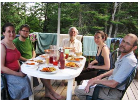
Lunch on the Refuge porch

St Mary of Egypt Refuge offers shelter, warmth and hope for persons and families in need. Accommodations are simple; students will share bedrooms and bathrooms and participate in some household tasks. Minimum 4 students; maximum 8 students.